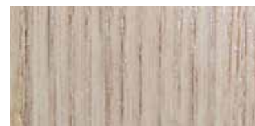
ASH WOOD LEGNO FRASSINO