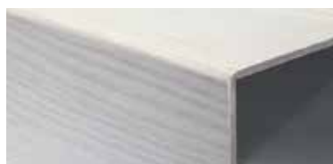
ALUMINIUM ASH - FRASSINO